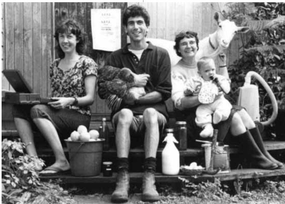
Tableland LETS Founders 1991