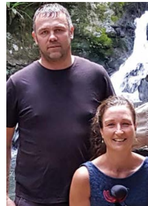
Sheldon & Blue

If you see them about, say Hi! Stay tuned for when & where to see the documentaries.