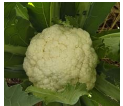
Our first ever homegrown cauliflower

Finally, just before I was supposed to go get the kids, I went into our covered gardens to collect salad and veggies for dinner. I took to the kitchen a large basket overflowing with lettuce, fennel, kale, chickweed, miniature broccoli stems, and a cauliflower – our first ever.